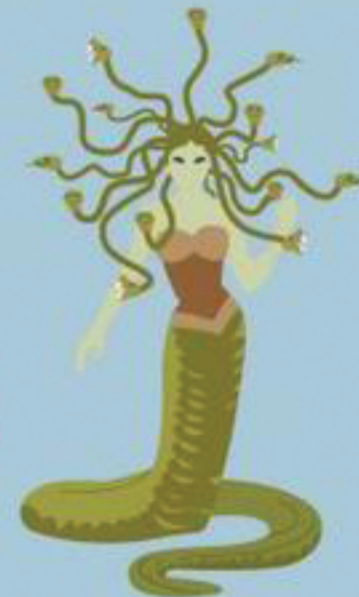
Medusa Greece Snake-haired woman whose direct gaze petrifies.