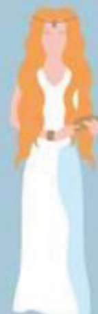
Xana Spain Exquisite female water nymphs with hypnotic voices.