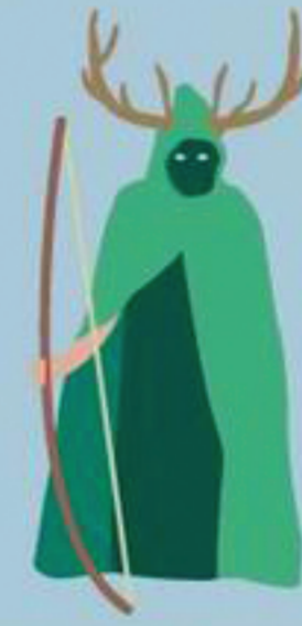
Herne the Hunter England The antlered spirit of a hanged man that guards Windsor Forest.