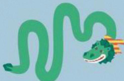
La Guita Xica Spain Green, serpentine dragon that protects the people of Catalonia.