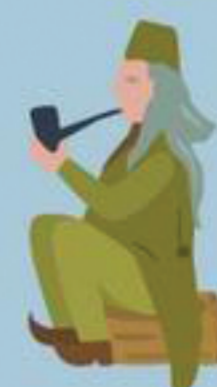
Vodnik Czech Republic Amphibious human spirit with bizarre clothing that store souls in porcelain cups.