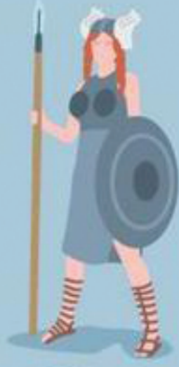
Valkyrie Scandinavia Warrior woman who chooses who dies or lives in battle.