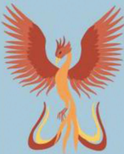
Phoenix Greece Fire bird that eternally regenerates from its own ashes.