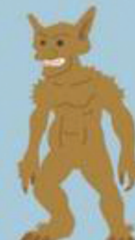
Alp Germany Shapeshifting goblin that evokes nightmares in sleeping victims.