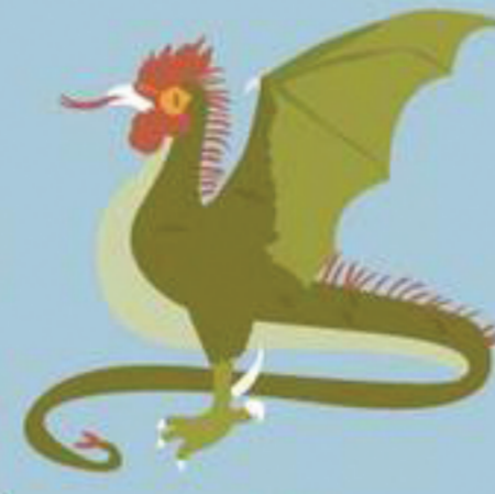
Basilisk British Isles Winged, cockerel-headed reptile that murders with a single glance.