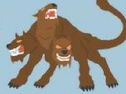
Cerberus Greece Multi-headed hellhound that guards the entrance to the underworld.