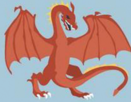
European Dragon Europe Powerful winged reptile that breathes fire and hoards treasure.