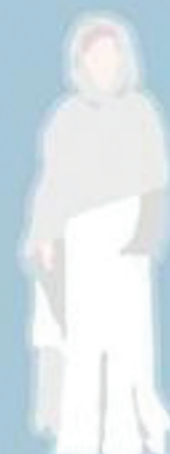
Dames Blanches France Ghostly women in white who destroys those that refuse to dance.