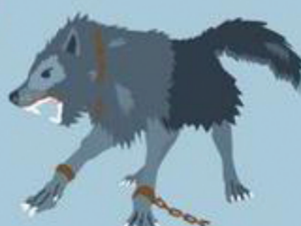
Fenrir Scandinavia Monstrous wolf destined to devour the world.