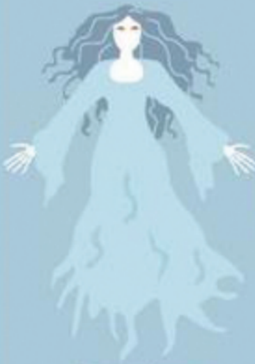
Banshee Ireland Female spirit that screams as an omen of death.