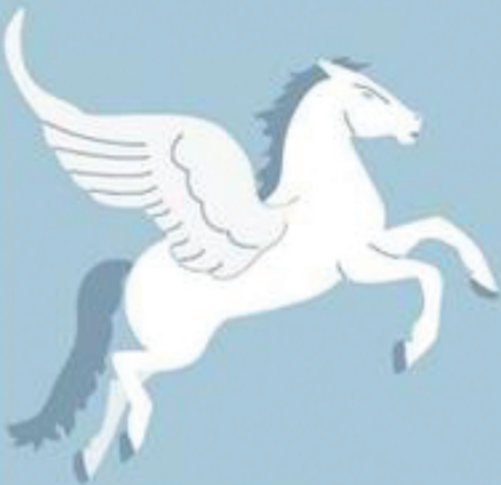
Pegasus Greece Winged stallion that helps heroes conquer deadly foes.