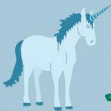
Unicorn Greece Dazzling horse with a spiraling horn.