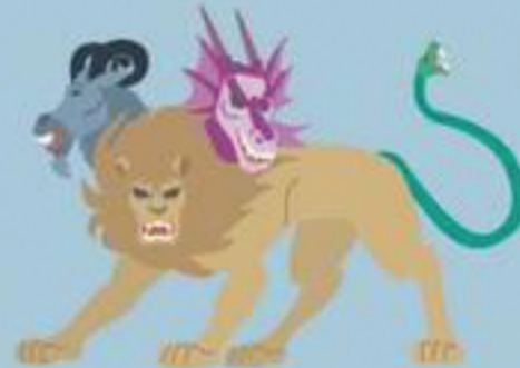
Chimera Greece Fire-breathing hybridization of a lion, goat, and snake.