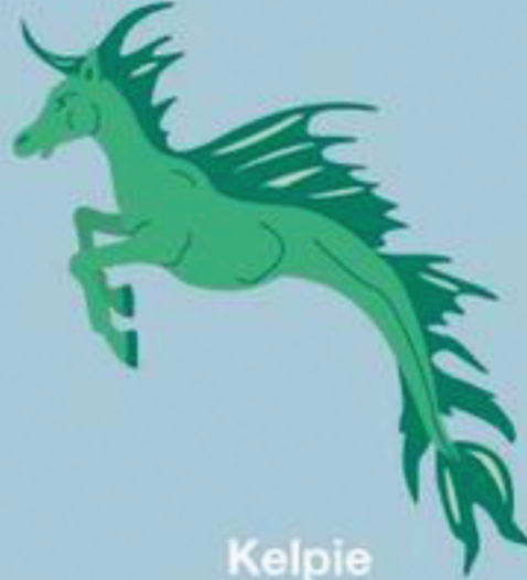
Kelpie Scotland Water horse that lures victims to ride on its back to their doom.