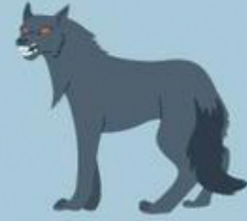
Black Shuck England Ghostly black dog whose direct gaze dooms you to death within a year.